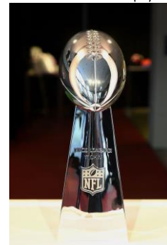
ON THE COVER Vince Lombardi Trophy

https://www.express.co.uk/sport/nfl/1081835/Super-Bowl-Vince-Lombardi-trophy-how-much-worth-weight-height-facts