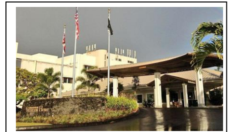
The Yukio Okutsu State Veterans Home.

Once inside the veterans home, the virus spread rapidly. By Sept. 6, when U.S. Sen. Brian Schatz, D-Hawaii, called for VA to help stop the outbreak, 46 residents and 18 staff members had contracted COVID-19, and five residents had died. As of mid-October, 71 of the original 89 residents and 35 staff