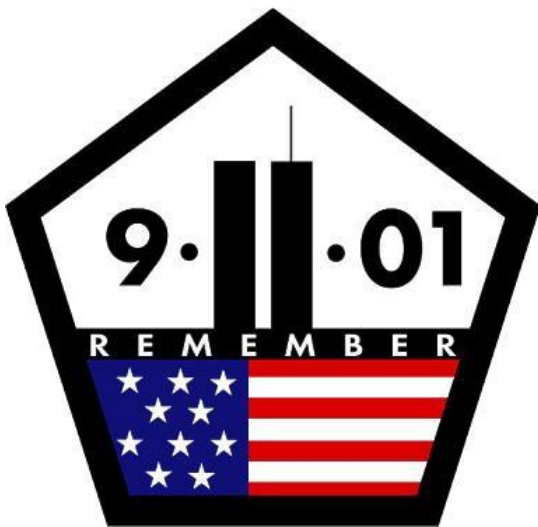
COVER PHOTO: Raising the Flag

"Serving Those Who Served... Full Steam Ahead"