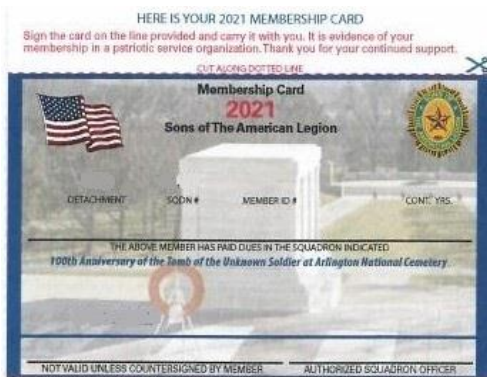
Thanks for still serving America.