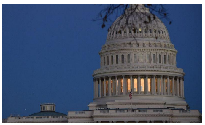
Annual Washington Conference taking place Feb. 25-27