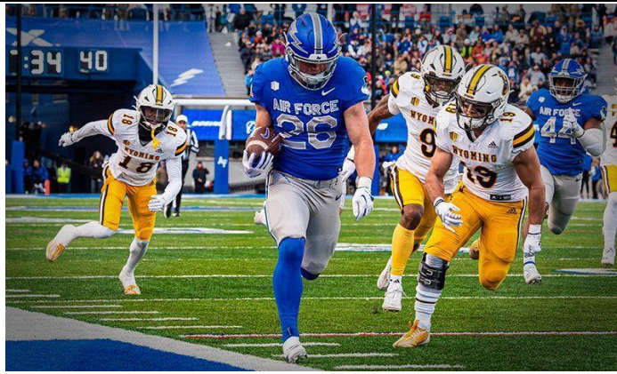
Air Force brings a 6-0 and No. 22 ranking into this weekend's game with Navy.