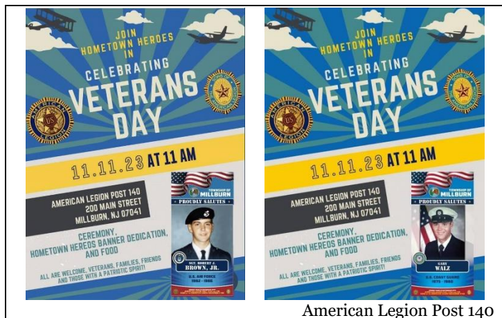
American Legion Post 140

Veterans Day is November 11, and the program begins at 11:00 a.m. at 200 Main St. The ceremony will be followed by banner dedications and refreshments.