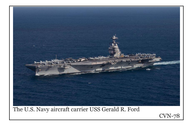
The American Legion | October 9, 2023