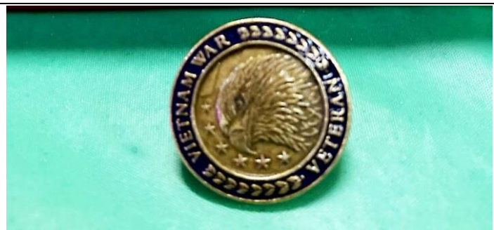
The Vietnam Veteran Lapel Pin honors living United States veterans who served active duty in the U.S. Armed Forces anytime and anywhere from Nov. 1, 1955 to May 15, 1975.

The pinning ceremony was part of the United States of America Vietnam War 50th Anniversary Commemoration that was launched by President Barack Obama on Memorial Day 2012 and continuing through Veterans Day 2025 to partner with local governments, private organizations and communities for ceremonies recognizing Vietnam War veterans.