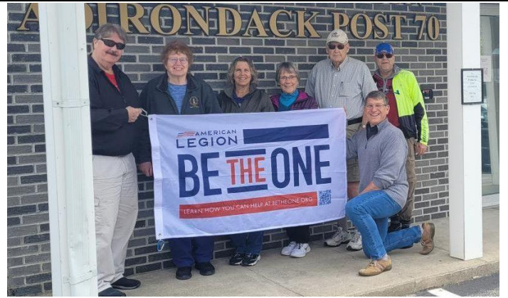
Legion Family members of Post 70 in Saratoga Springs, N.Y., walk weekly for health and wellness.

have been walking one mile from the post home every Wednesday at 1 p.m.