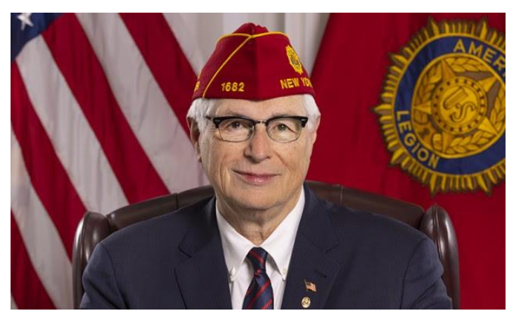
Staying on top June 28, 2023

Dear American Legion Family members and friends,