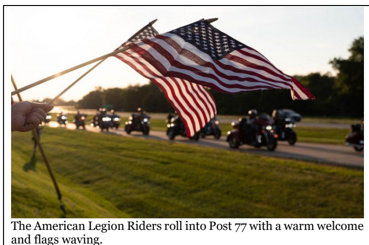
The American Legion Riders roll into Post 77 with a warm welcome and flags waving.