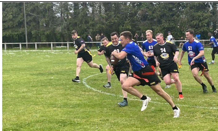
A ball carrier for the 82nd Airborne Division rushes around the end in the Patton Foundation Remembrance Bowl flag football game at Chef du Pont during commemoration of the D-Day anniversary events in Normandy.