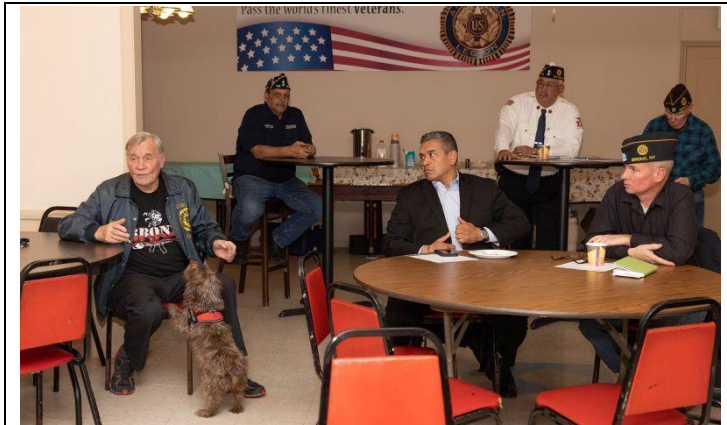
American Legion Post 620 in Bronx, N.Y., hosted a System Worth Saving town hall.

Meeting ID: 941 4100 3972 | 378 079 (646) 931-3860