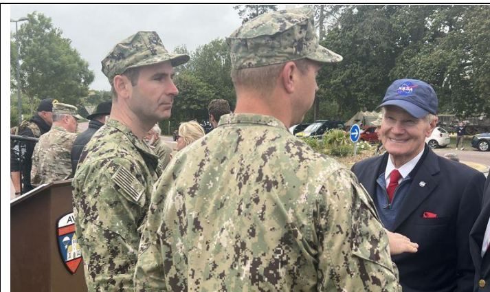
Former U.S. Sen. Bill Nelson, now the administrator of NASA, speaks with soldiers at the June 5 Statue of Liberation ceremony in Ste. Mere-Eglise.