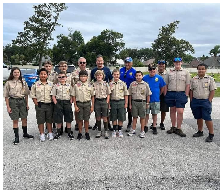
Members of Sons of the American Legion Post 267 and Boy Scouts from Troop 403.

403, placed flags on veterans' graves at Volusia Memorial Gardens over the Memorial Day weekend.