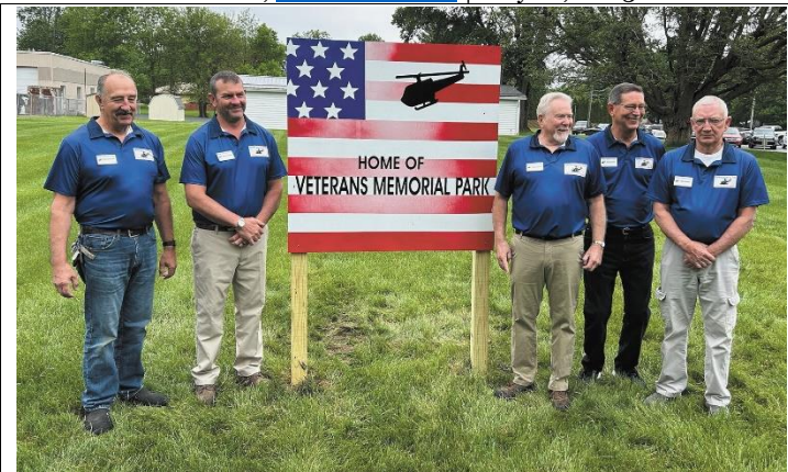
Five of the six Veterans Memorial Park board members gather Monday for a photo announcing the creation of the new park.