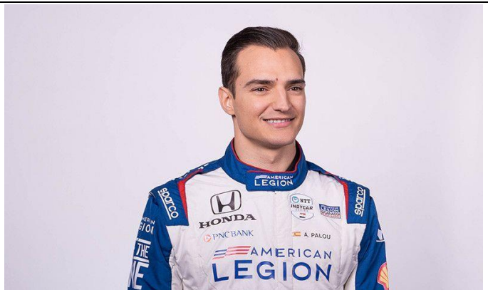
A behind the scenes portrait of Chip Ganassi Racing Driver Alex Palou during a video production for Chip Ganassi Racing Production Day at Chip Ganassi Racing Headquarters in Indianapolis, Ind., on Wednesday, January 11.