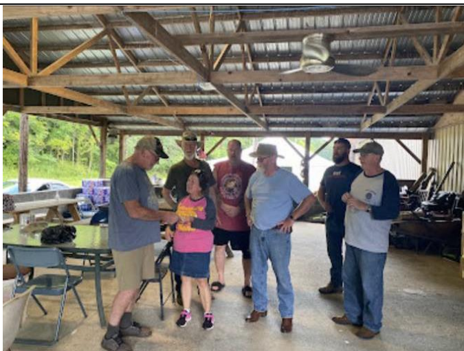
Squadron 138 members presenting a check to American Legion Post 152 in Whitesburg, KY in the amount of $3,000 for the aftermath from the floods.

SAL Squadron 138 Hamilton, Ohio mission was to collect donations and money for the aftermath of the floods that devastated Southeastern Kentucky. They contacted Douglas Day American Legion Post 152 in Whitesburg, KY. to see how they could help the Post that was helping Legion members and residences of Whitesburg.