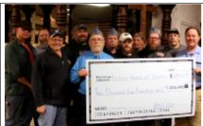
Squadron 61 Sons of the American Legion presented a check of $2,500 to The Fisher House of Omaha.

The squadron has 26 members in this area who give of their time to support vets in any way they can.