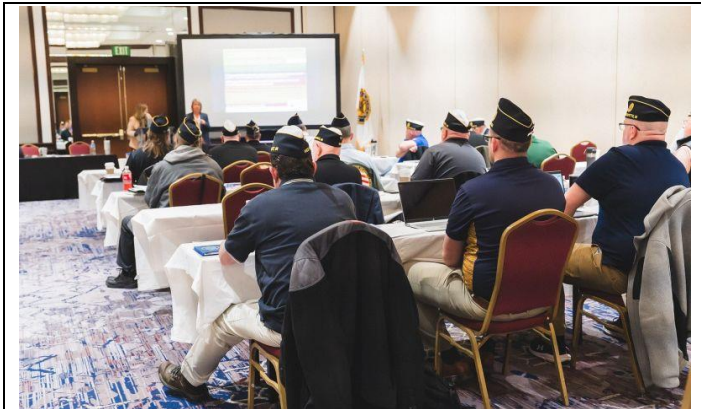
Department of Indiana Legion College Students took part in a Be the One training session developed by the Columbia Lighthouse Project on Thursday, April 4.