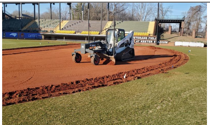
Workers scrape excess dirt from the infield at Veterans Field at Keeter Stadium in Shelby, N.C.

DuraEdge Products Inc., of Grove City, Pa., brought in 125 tons of materials to upgrade the infield.