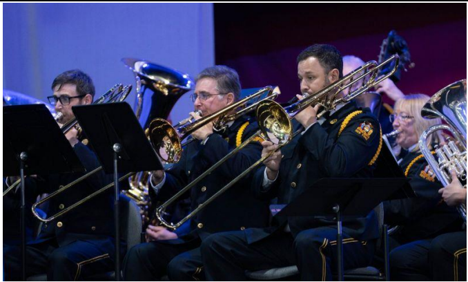
The American Legion Band of the Tonawandas competes in the band contest at the 103rd National Convention in Milwaukee in 2022.